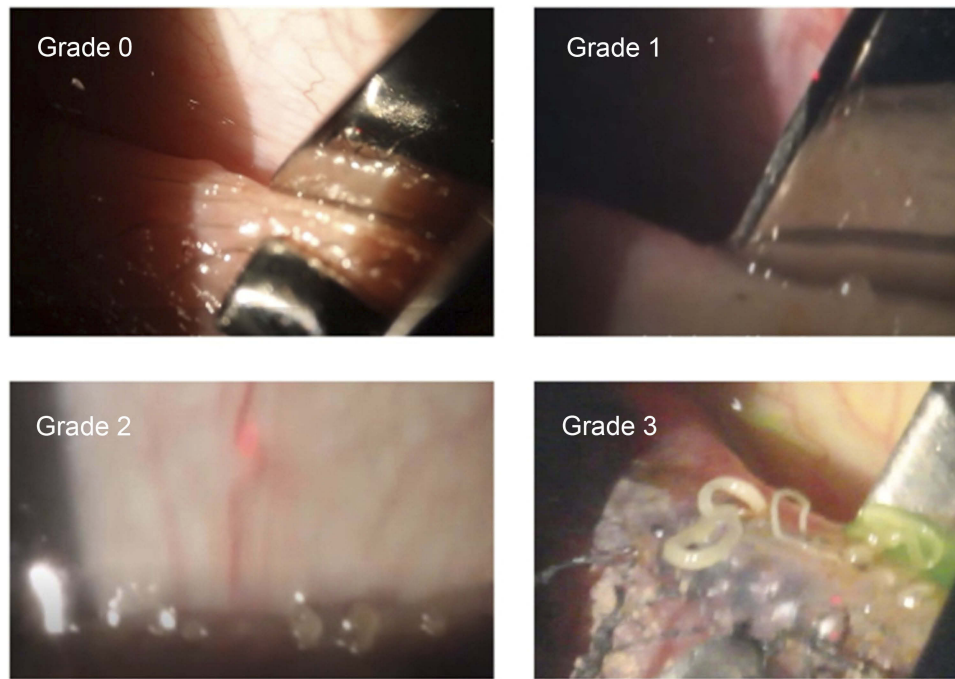
Figure 1 The MGD subjective grading scale.

Notes: Grade 0 is normal meibum easily expressed. Grade 1 is meibum easily expressed, but with with a more turbid oil. Grade 2 includes the presence of more turbid oil and a more viscous appearance. Grade 3 is the expression of “ropy” meibum. Grade 4 is no expression from the glands despite multiple attempts.